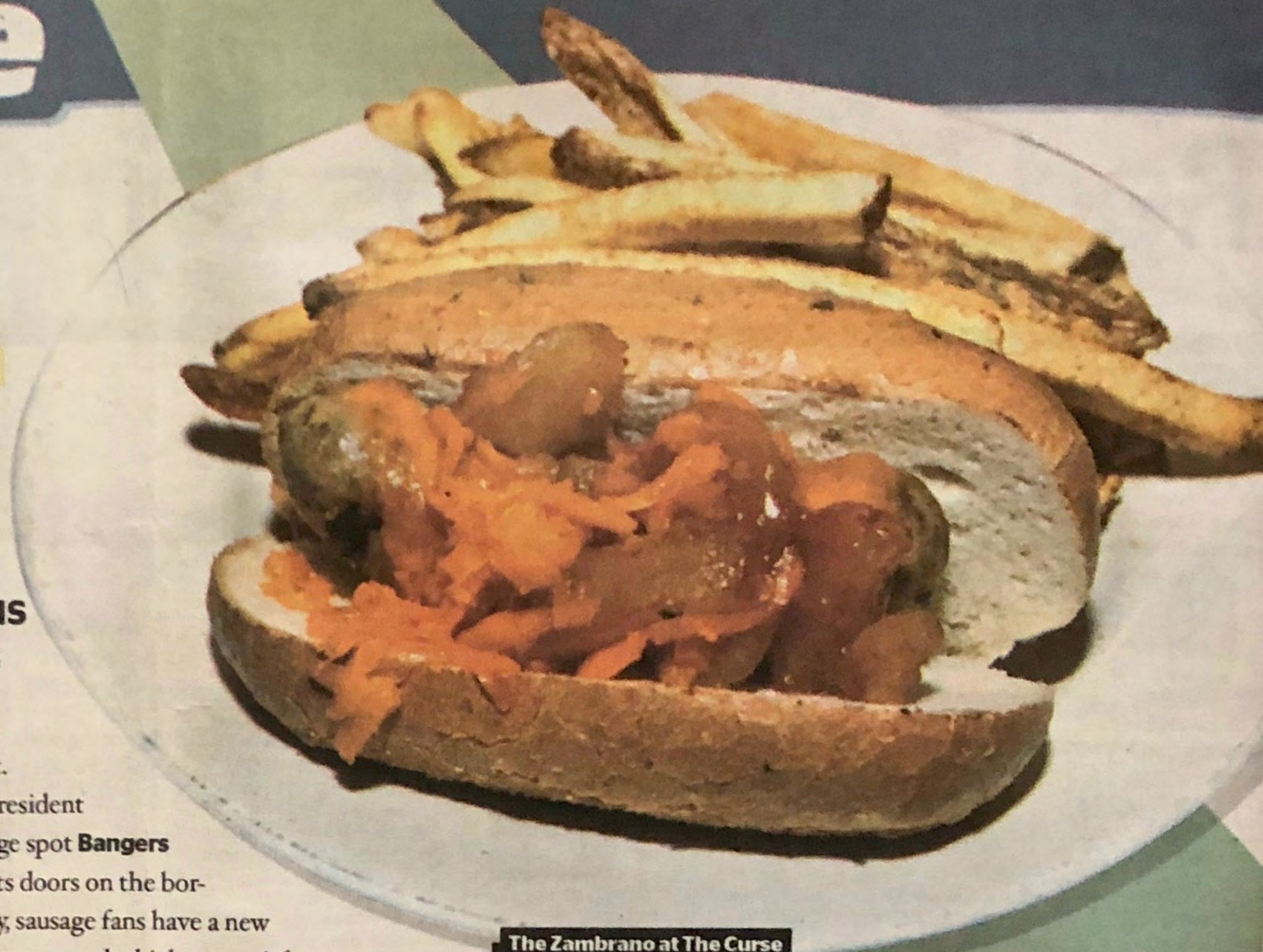
The Zambrano at The Curse

Since opening in August, The Curse (3517 N. Clark St. 773-935-6694) has established itself as Wrigleyville's resident sausage-centric sports bar. Now that beer-and-sausage spot Bangers & Lace (1670 W. Division St. 773-252-6499) opened its doors on the border of Wicker Park and Ukrainian Village on Tuesday, sausage fans have a new place to sink their teeth into. Which has the rarest beers—and which can satisfy your most intense cravings for a goat bratwurst? Read on to find out.